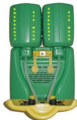
7 Gallon Safe Stream

Bacteriostatic Additive, test log card included