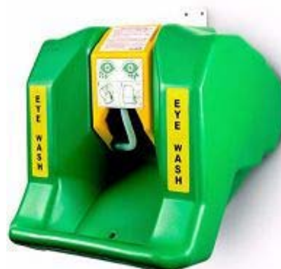
16 Gallon Primary EyeWash Station

Wall-mounted eyewash station is both convenient and effective for use in emergencies. The portable, gravity-fed unit requires no plumbing and has a 15 minute flow time. Designed for easy operation, this system can be used with just one hand.